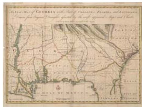
A New Map of Georgia, with Part of Carolina, Florida, and Louisiana by E. Bowen, c. 1748